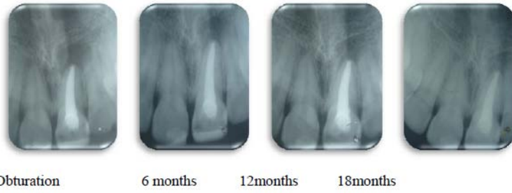
Photo activated disinfection